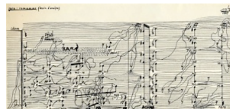
Graphic notation. Sylvano Bussotti: Rara : romamor from the score for Rara Requiem , 1969