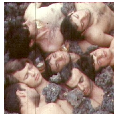
A still from the film Rara

“A large portion of the film is made of closeups: because sometime we are left without context, and we are left without the key to really read these shapes, the discourse veer towards the abstract, with colors and unrecognizable shapes dominating your experience. Probably the most moving part of the film is a long sequence of men crying. Throughout this sequence, it becomes more and more ambiguous whether they're crying, or if it's raining, or if pearl-like appliques are used as make-up, etc: this process, especially when it's up so close, makes you really question what you're really seeing.